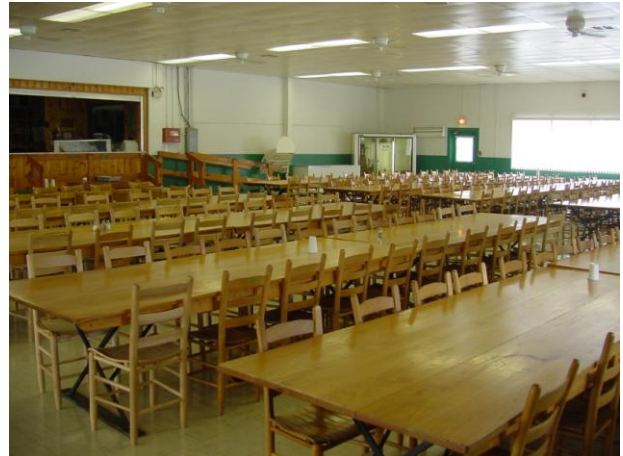
Main Seating Area