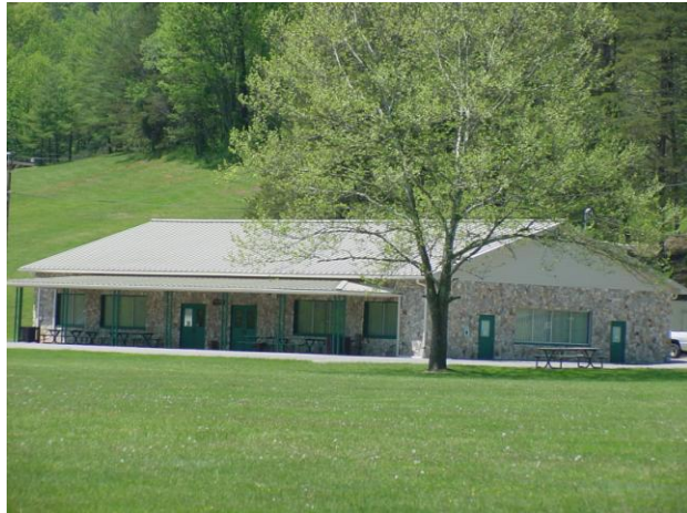
Outside View of Dining Hall